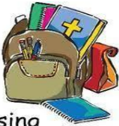
Blessing of the Backpacks